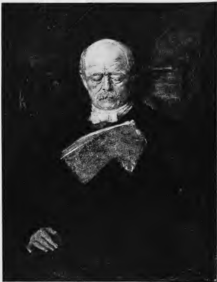
PRINCE BISMARCK. AFTER A PORTRAIT BY LENBACH